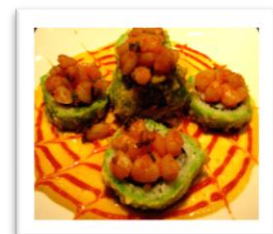
40. Vegas Roll