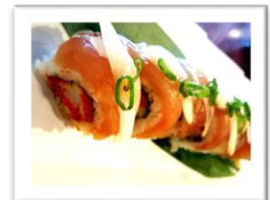
28. Osaka Roll