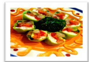
9. Protein Roll