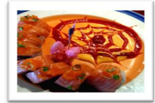
15. Pink Roll