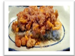
32. Popcorn Lobster Roll

In: spicy tuna, imitation crab, avocado, jalapeno, gobo, cream cheese Out: soy paper and deep fried with spicy mayo and eel sauce