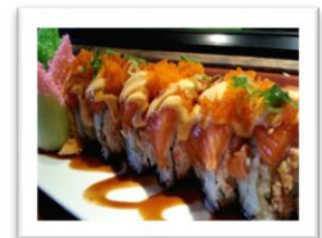
29. Holiday Roll