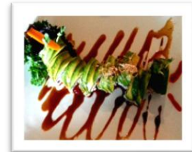
35. Caterpillar Roll