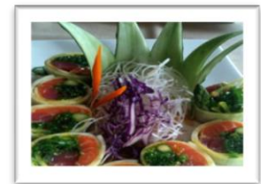
7. Blue Ocean Roll