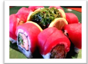
19. Hawaiian Roll