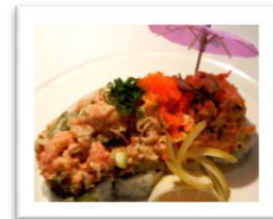
38. Lobster Beach Roll