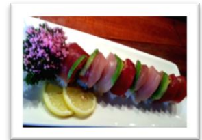
4. Sunrise Roll