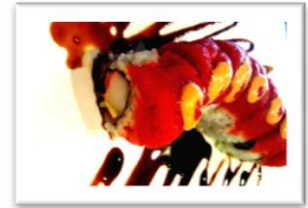
3. Red Caterpillar Roll

Out: albacore, avocado, garlic with ponzu and hot sauce