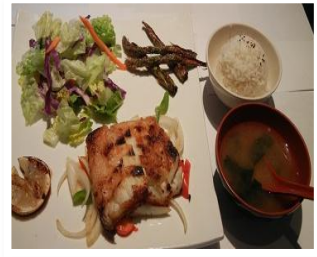
12.Chilean Sea Bass