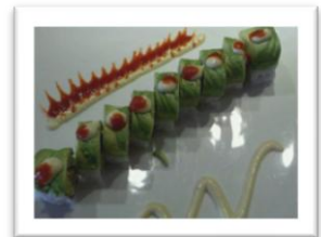
20. 911 Roll